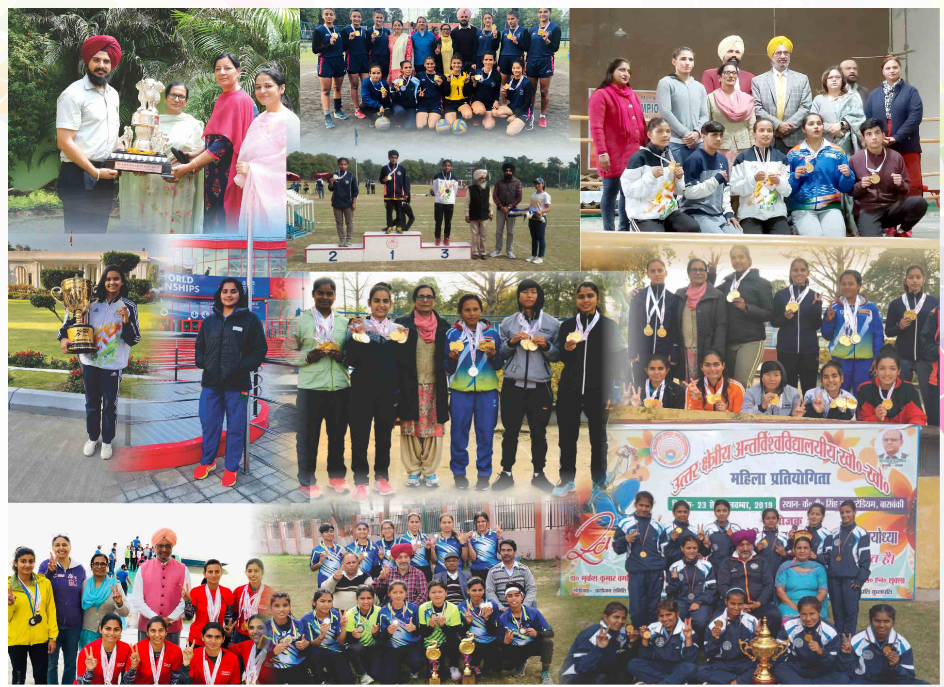
Teams of Guru Gobind Singh College for Women clinched many Winner's Trophies